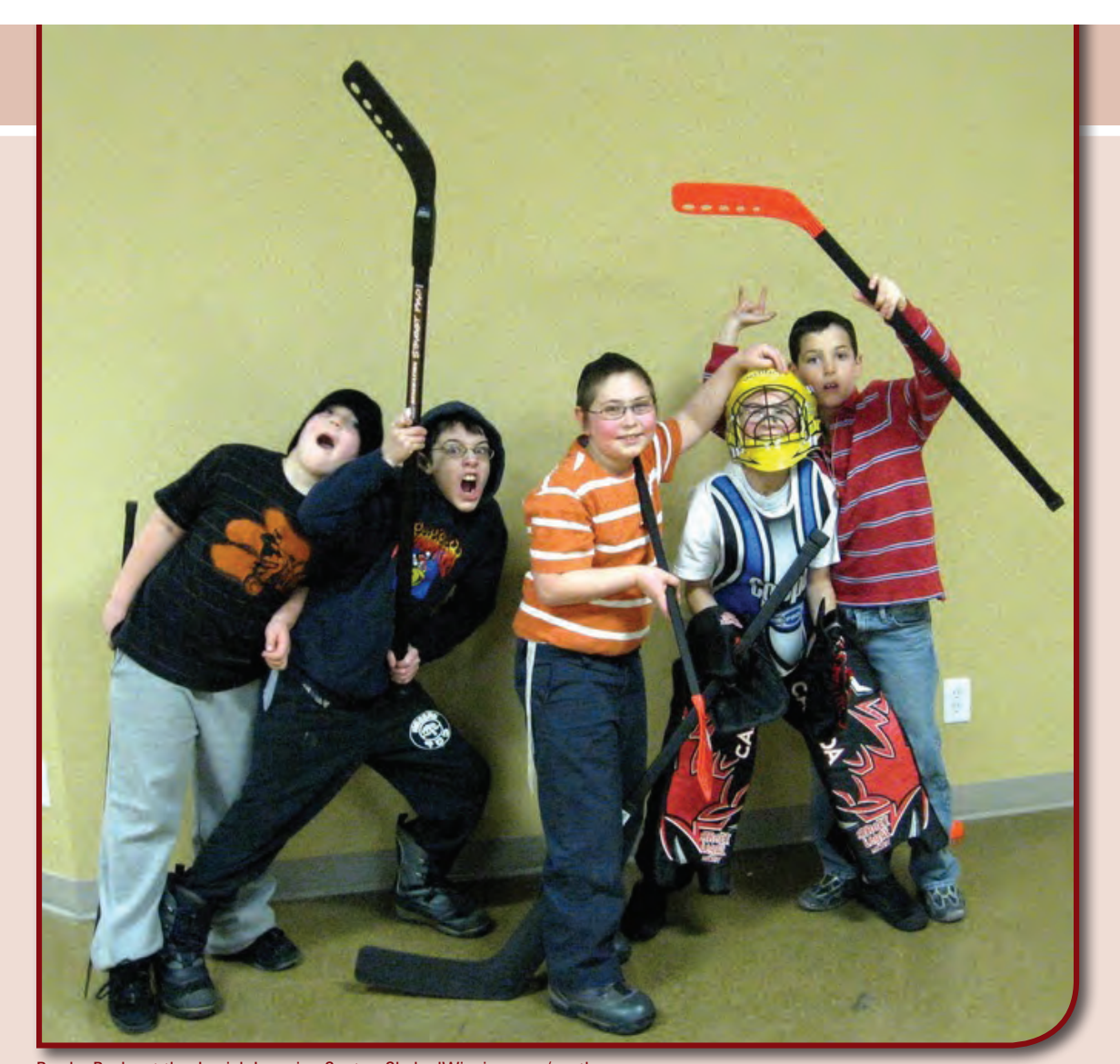
Parsha Pucks at the Jewish Learning Centre.